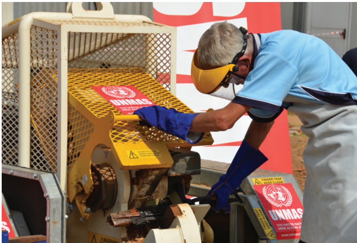
UNMAS weapon cutting shear.

In the Central African Republic, UNMAS supports the national authority in the management of storage and security of small arms, light weapons and ammunition stockpiles and collects and destroys surplus, seized, or illicitly held weapons and ammunition. Activities in 2014 included the disposal of more than seven tons of unserviceable ammunition and the assessment of multiple police and military weapons