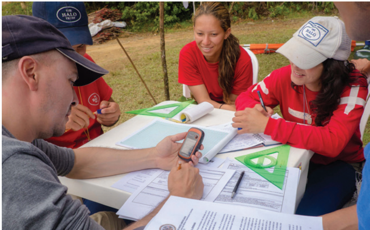
UNMAS funded Partner HALO Trust conducts non-technical survey in El Retiro, Colombia.

In Colombia, UNMAS-funded non-technical survey (NTS) teams assessed 205 villages, determining many suspected danger zones as safe. The survey teams interviewed 6,259 households living near suspected areas of contamination. Mine clearance following the surveys enabled two land restitution projects, a central policy of the Government of Colombia, and development projects in two municipalities.