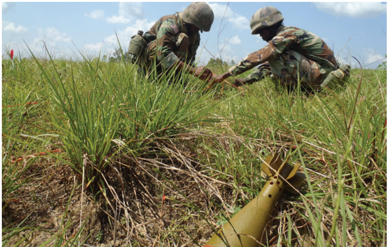
The Armed Forces of Liberia receive EOD training from UNMAS.

UNMAS EOD activities in Liberia contributed to the transition of security responsibilities to national actors. An UNMAS training programme strengthened the capability of the Armed Forces of Liberia to safely manage the residual threat from ERW. In addition, UNMAS trained national police instructors in ERW recognition and safety awareness. These instructors subsequently delivered the UNMAS-designed training package to 342 in-service officers and new recruits.