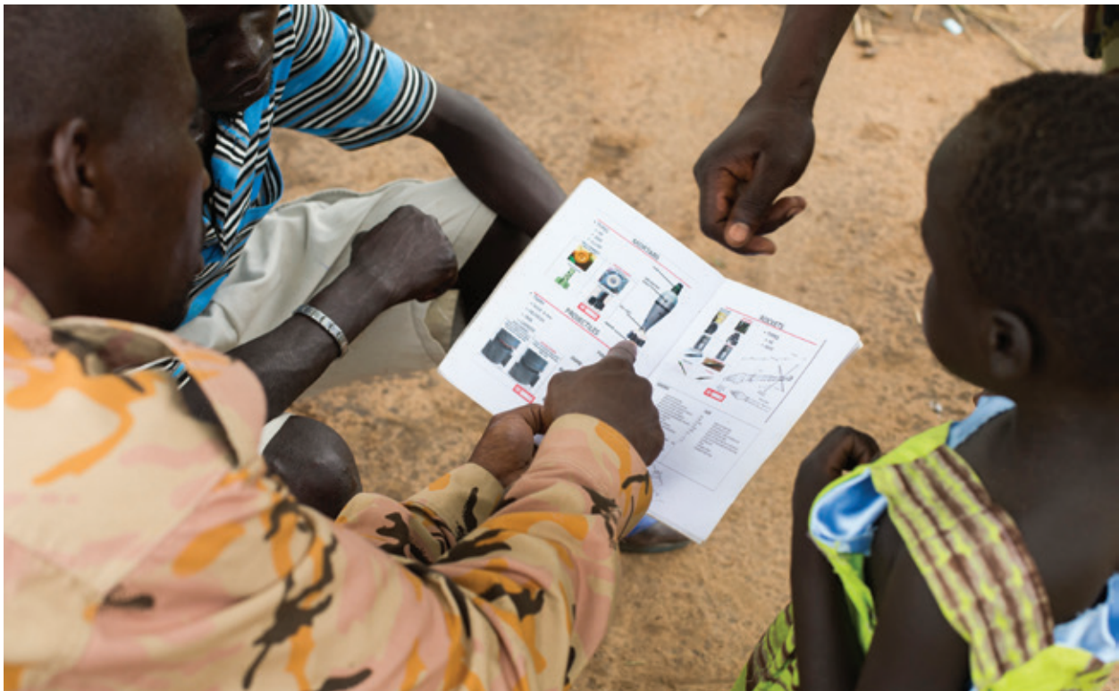
At the port at Mingkaman, South Sudan, UNMAS disseminated risk education messaging to adult IDPs traversing the Nile River to Bor. After each boat departed, the team returned to the camp to educate IDP children about explosive hazards using songs and games.

Posing a threat to civilians and humanitarian actors, unsecured and poorly managed stockpiles can