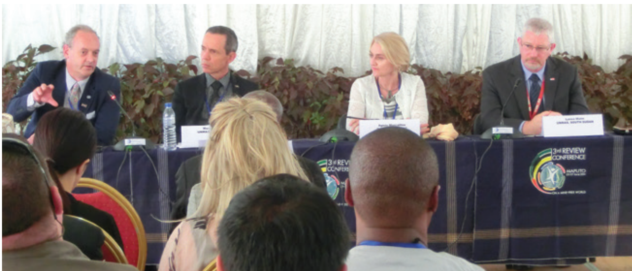
UNMAS brings experience from the field to the Third Review Conference of the APMBC, in Maputo, Mozambique.

UNMAS also responded to a request from the Federal Government of Somalia to provide assistance in meeting its obligations under the partial lifting of the arms embargo established by the Security Council. UNMAS advised the Federal Government as it established a comprehensive weapons and ammunition management system that will be implemented in 2015-2016. UNMAS