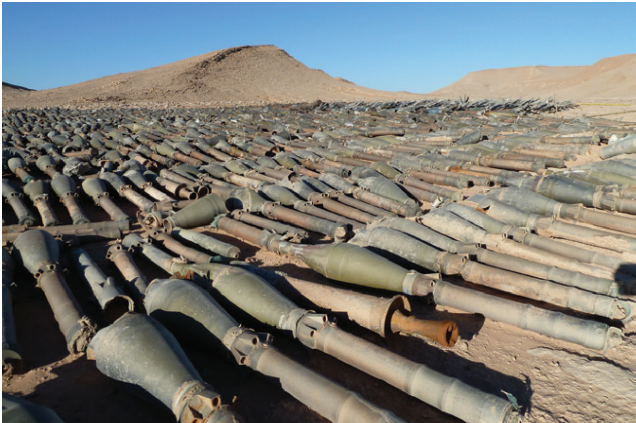
Tons of unsecured weapons and ammunition litter Libya.

UNMAS objectives in Libya are to strengthen the Government's control of unsecured arms and ammunition, enhance counter-proliferation activities and assist the Libyan Mine Action Centre (LibMAC) through clearance, risk education, technical advice and international advocacy. UNMAS also aims to reinforce national authorities through the delivery of technical and operational support to security institutions, including the Ministries of Defence, Foreign Affairs and the Interior, through developing technical frameworks, advising on institutional governance structures and coordinating partners' weapons and ammunitions management activities. Due to the security situation, the United Nations temporarily relocated UNSMIL staff to Tunisia in July 2014. UNMAS continues to support the LibMAC in delivering coordination, emergency clearance and risk education remotely and through periodic missions to Tripoli, as the security situation allows.