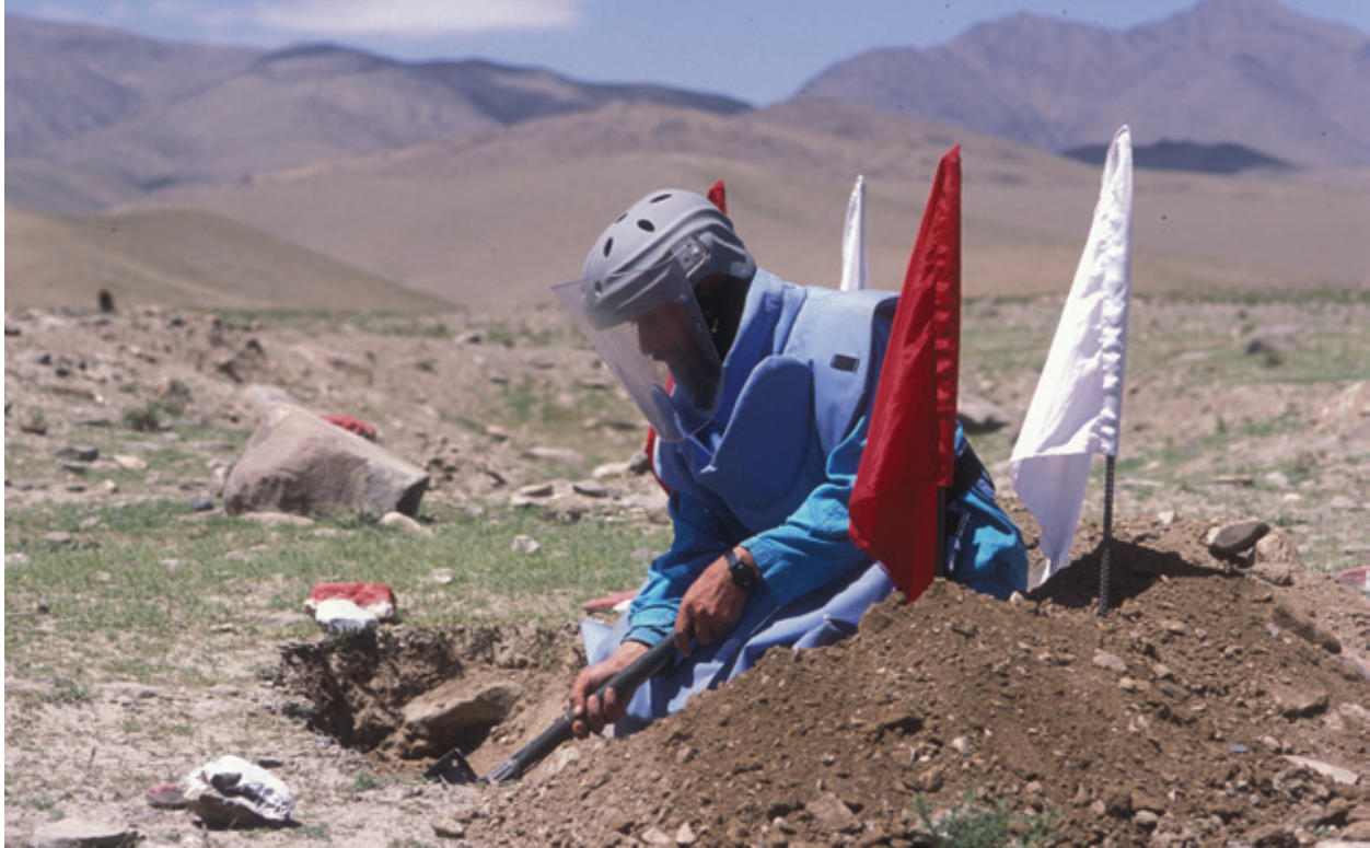
Afghan deminer at work. In 2014, clearance in Afghanistan resulted in mine-free status of 237 communities.

residential houses, key facilities, and economic opportunities for thousands of city dwellers.