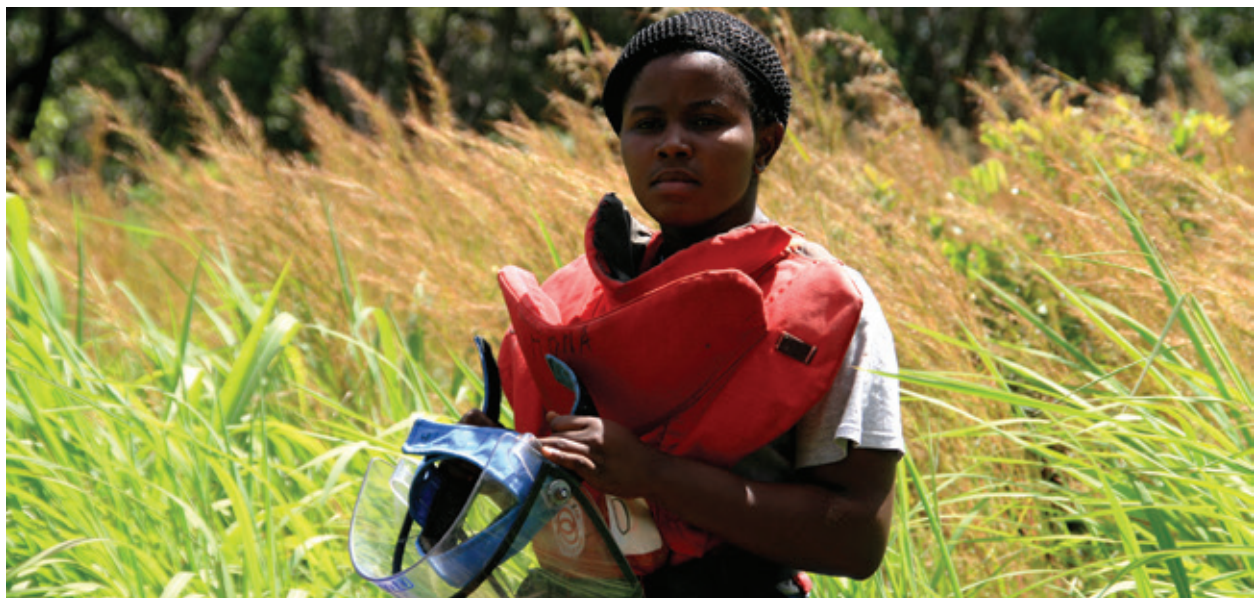
A female deminer at work in the Democratic Republic of the Congo. UNMAS and its partners promote gender equality in all field programmes.

At headquarters, in Geneva and globally, UNMAS drew attention to gender issues by identifying the theme “Empowering Women in Mine Action” for activities promoting the International Day for Mine Awareness and Assistance in Mine Action. A number of high-level events, panels and presentations were organized and publicized by UNMAS to highlight the contributions of women in mine action.