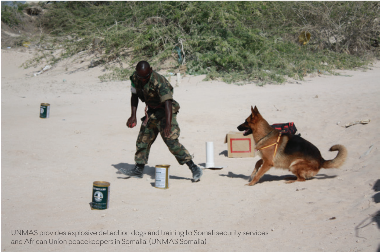
UNMAS provides explosive detection dogs and training to Somali security services and African Union peacekeepers in Somalia.

and the development of risk education manuals for schools in collaboration with the Ministry of Education.